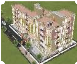
SURESH ENCLAVE Mangalam Colony, Bailey Road