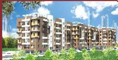
AT Bailey Road, Patna