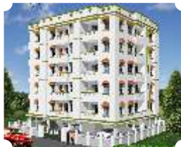
ANJU APARTMENT Abhiyanta Nagar