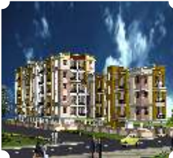
CHAMAN GARDEN Saguna More