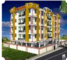
SAGAR ENCLAVE Ram Jaipal Nagar