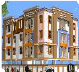
RAJ RANI PALACE Shivpuri