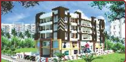
AT Saguna More, Patna