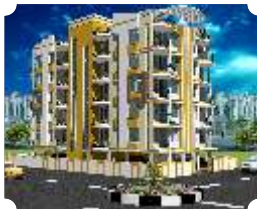
SRI GANESH SHAKUNTLAM Arya Samaj Road