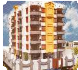
SRI GANESH KIRTI APARTMENT Bailey Road