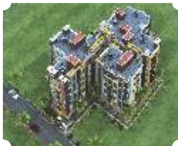
GORAKH VILLA R.K. Puram, Saguna More